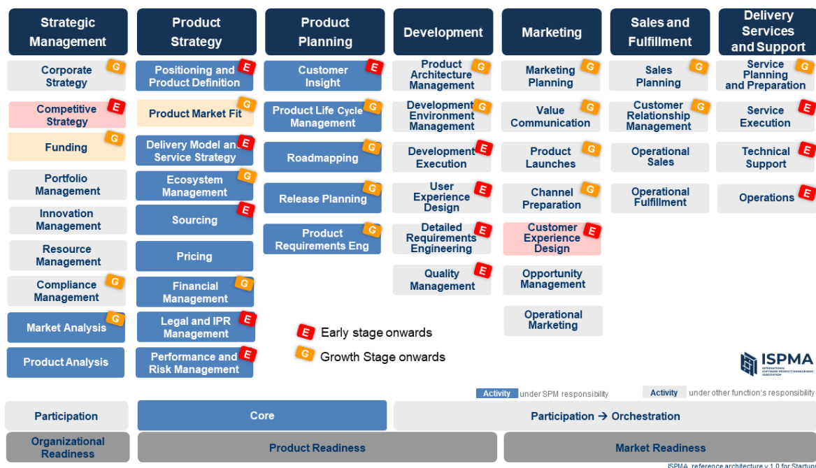
Fig. 1 Startup SPM Framework V.1.0